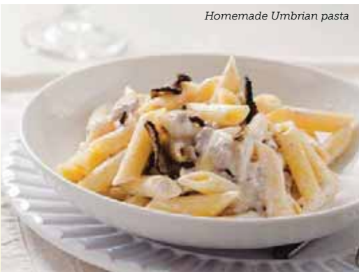
Homemade Umbrian pasta

Winery Cooking Demonstration. Visit a local Perugian winery to delight in a cooking demonstration. Learn the secrets of traditional Umbrian recipes as the chef prepares authentic dishes, such as homemade pasta and cakes. Then, indulge in the rustic, seasonal and flavorful cuisine with paired wines for lunch.