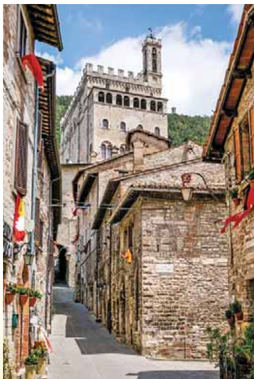
Medieval streets of Gubbio