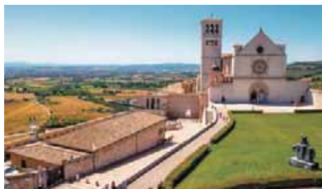
Basilica of San Francesco, Assisi