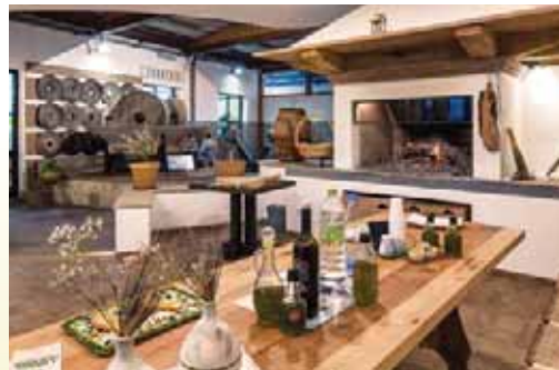
Oleoteca Bartolomei Olive Mill

A Day in Tuscany. Begin in the Etruscan city of Cortona, taking a guided walk past historic