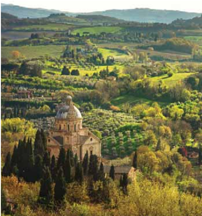
Tuscan landscape near Montepulciano